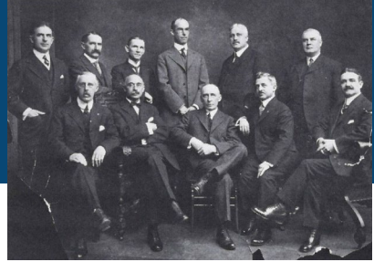
St. Joseph's Hospital Medical Staff, 1912.