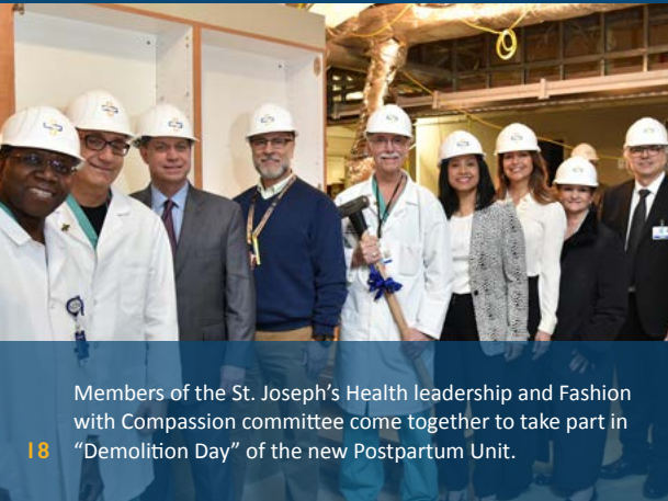
Members of the St. Joseph's Health leadership and Fashion with Compassion committee come together to take part in "Demolition Day" of the new Postpartum Unit.

Supporting the needs that arise in response to the COVID-19 pandemic as all of our facilities and teams focus on caring for patients and our community during this crisis.