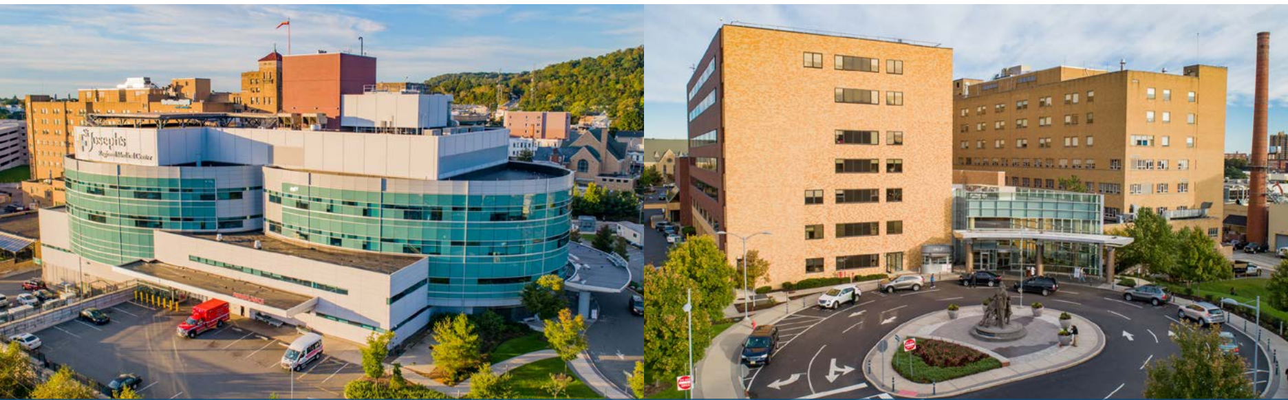
An exterior view of the Critical Care Building and helipad at St. Joseph's University Medical Center.

All of these improvements were made possible through the philanthropic investment of many individuals, corporations, foundations, and partners. Listed on the following pages are the donors and partners who contributed $1,000 or more to the St. Joseph's is the Future Capital Campaign. We are proud to formally acknowledge and express our deep gratitude to all who supported these efforts; thank you for helping St. Joseph's Health to achieve new heights!