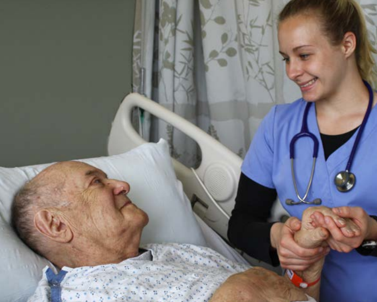
Our award-winning nursing staff continues to provide compassionate care.