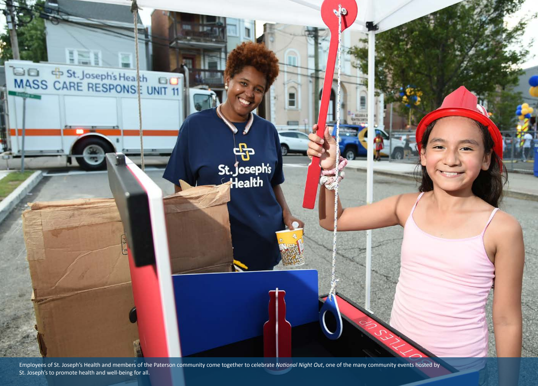
Employees of St. Joseph's Health and members of the Paterson community come together to celebrate National Night Out , one of the many community events hosted by St. Joseph's to promote health and well-being for all.