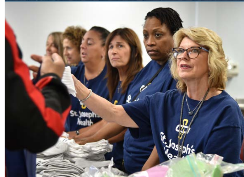
St. Joseph's Health employees take time to volunteer with a number of local nonprofit organizations.