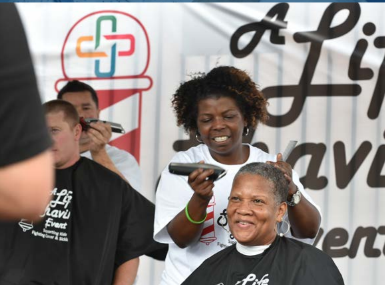
St. Joseph's Health teams up with local first responders to host A Life Shaving Event to raise awareness of pediatric cancer and sickle cell disease.