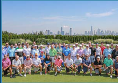
Golfers at the Liberty National Golf Outing enjoy a perfect day to hit the links!