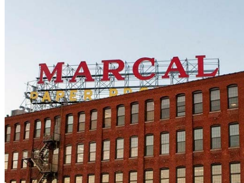
The iconic Marcal building sign as it once stood in Elmwood Park, NJ, before the devastating fire on January 30, 2019.